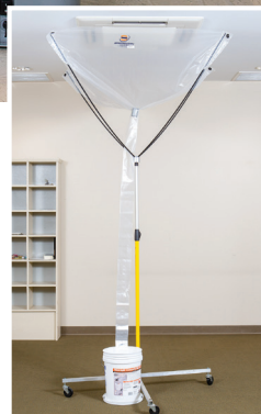
Mini-Split Cassette Bib Stand

Visit www.speedclean.com for a complete list of accessories