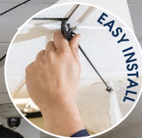
Mini-Split Cassette Bib Stand

Complete kit includes: Cassette bib, adjustable bungee cord, mounting hooks and a five gallon bucket.