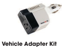
Vehicle Adapter Kit