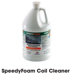
SpeedyFoam Coil Cleaner