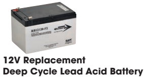
12V Replacement Deep Cycle Lead Acid Battery