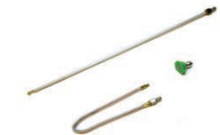
CoilJet Mini-Split Accessory Kit