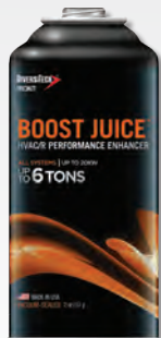
Boost Juice Part# 993KIT