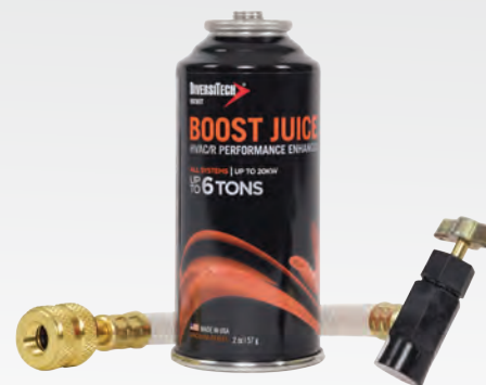
Boost Juice in can (One-time use hose included)