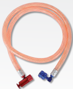
Boost Juice Inject Part# 992