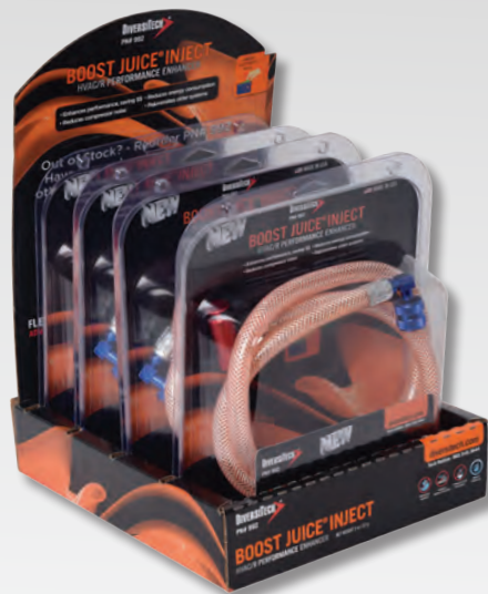
Boost Juice Inject Part# 992