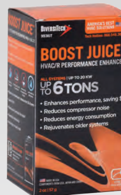
Boost Juice in kit Part# 993KIT